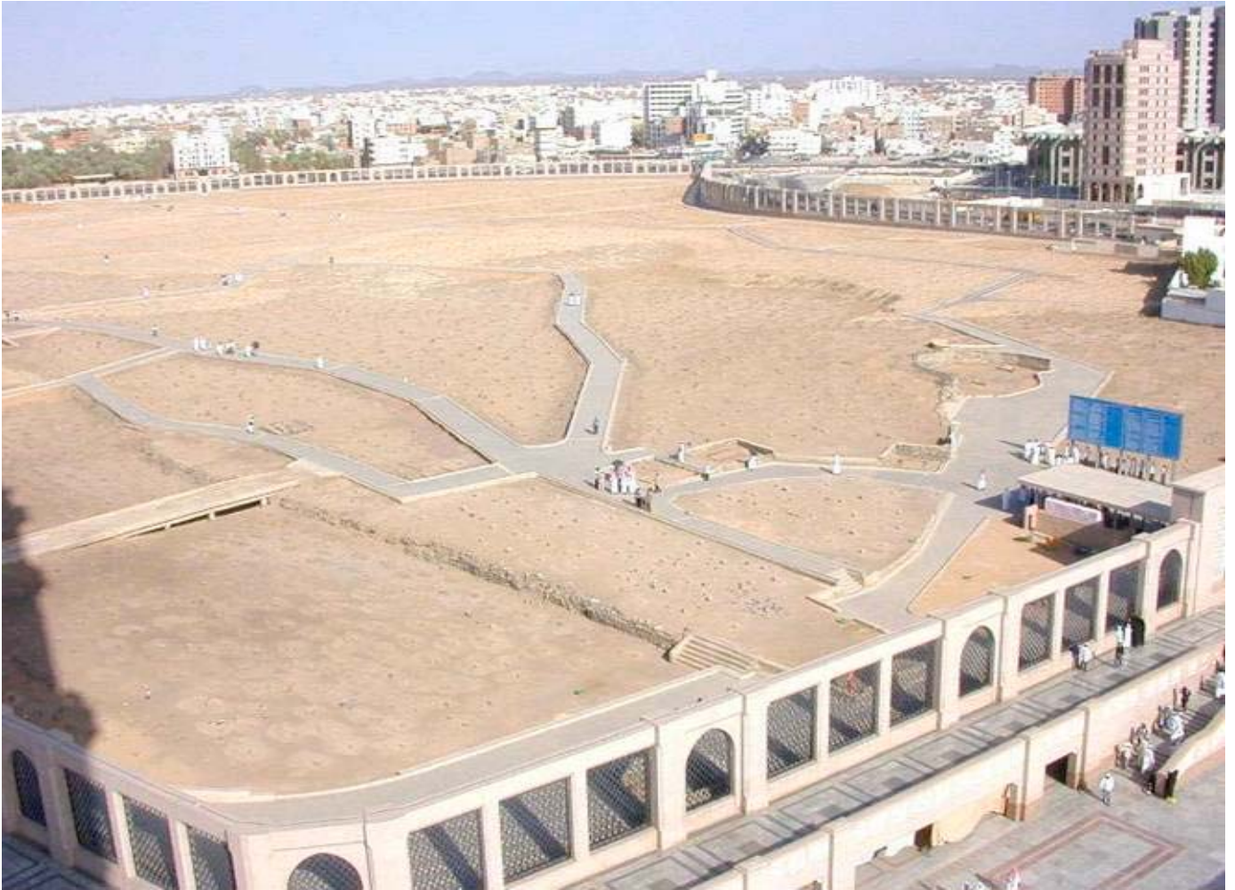
A look of complete cemetery and passages of holy Madina Jannat-ul-baqi