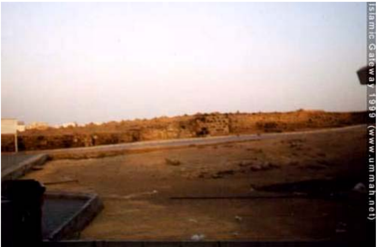
View of holy cemetery -Madina

pigeons flying and eating grains in holy graveyard---baqqi.